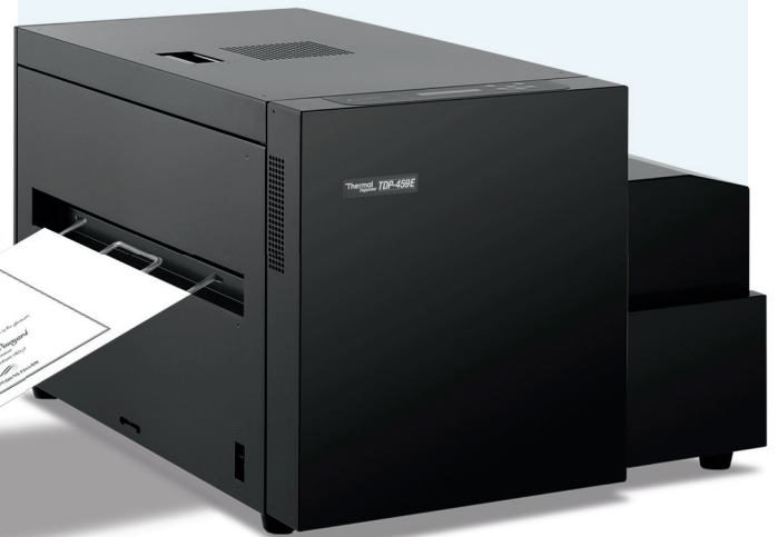
(IFL or IFS)